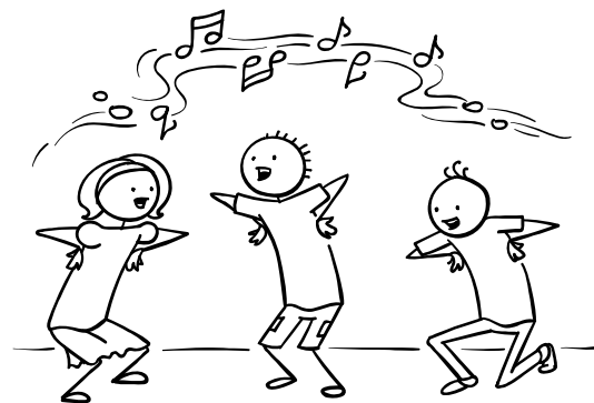
"I am a duck"