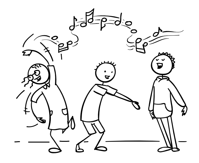
"I am swimming (swimming!)"