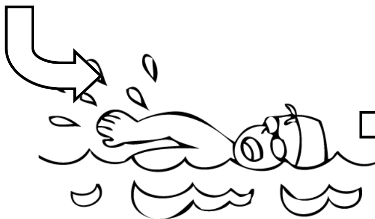
I can swim