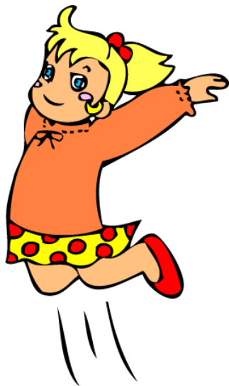
I can jump