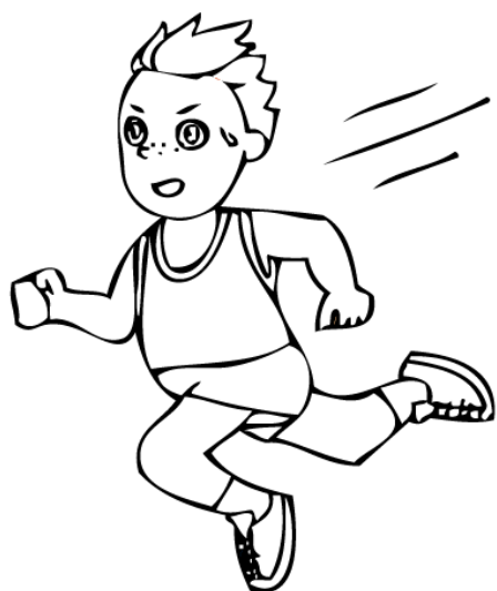
I can run