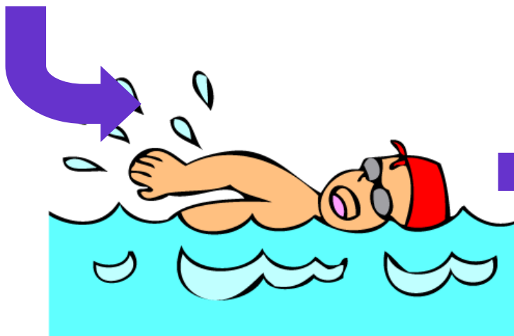
I can swim