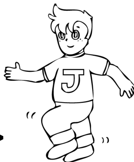
I can stomp my feet