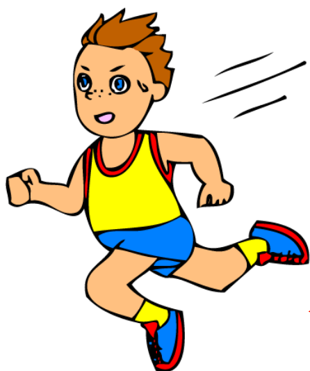
I can run