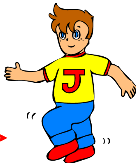
I can stomp my feet