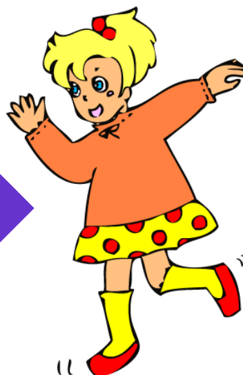
I can hop