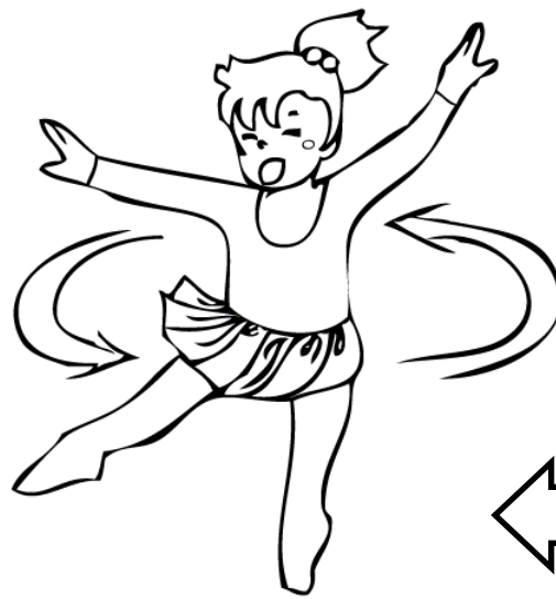
I can turn around