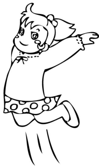
I can jump