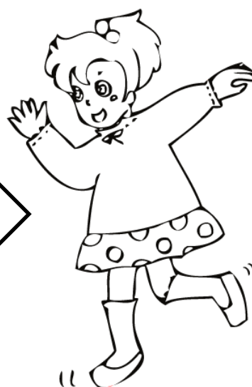
I can hop