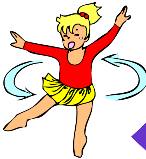
I can turn around