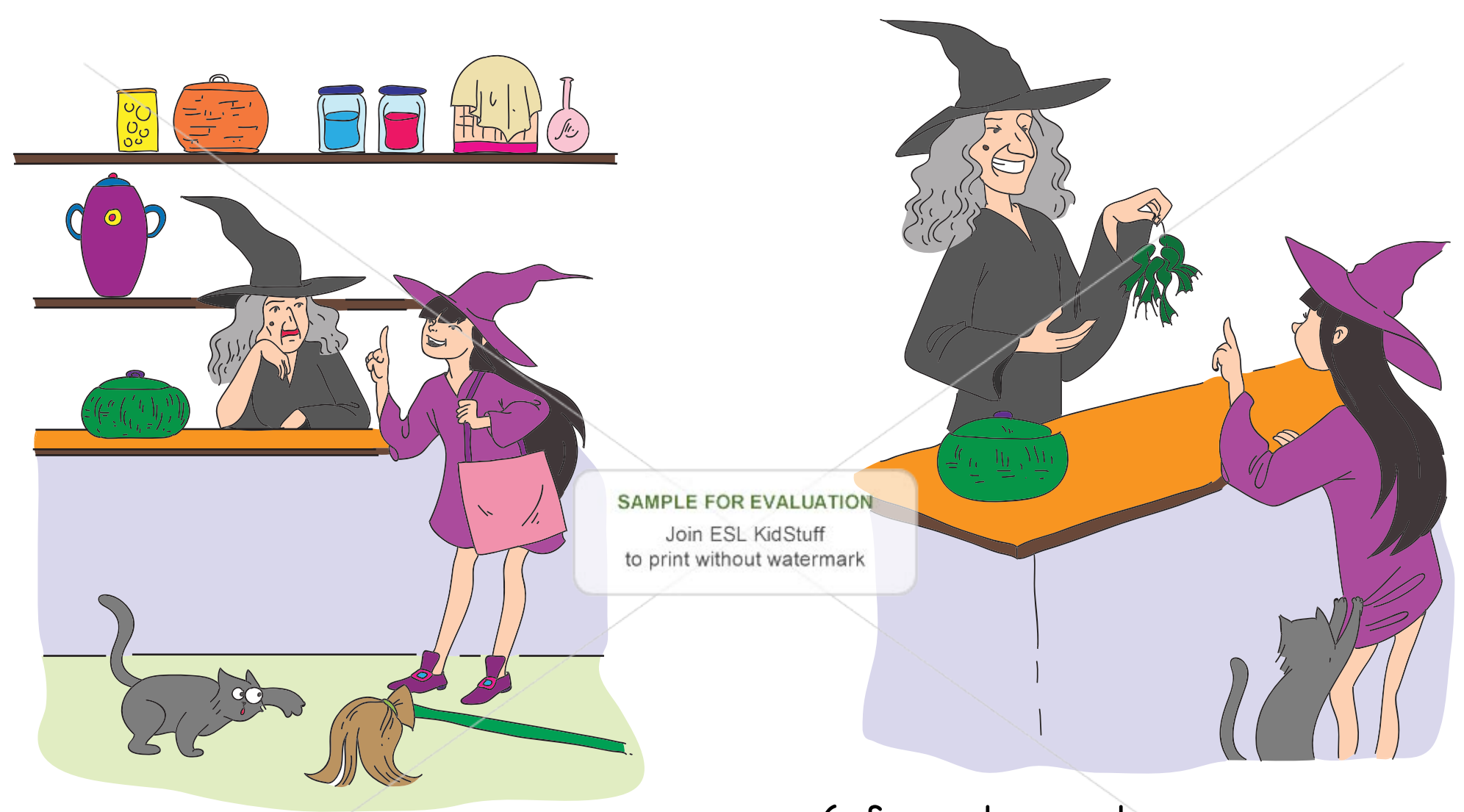
Hello, may I help you?